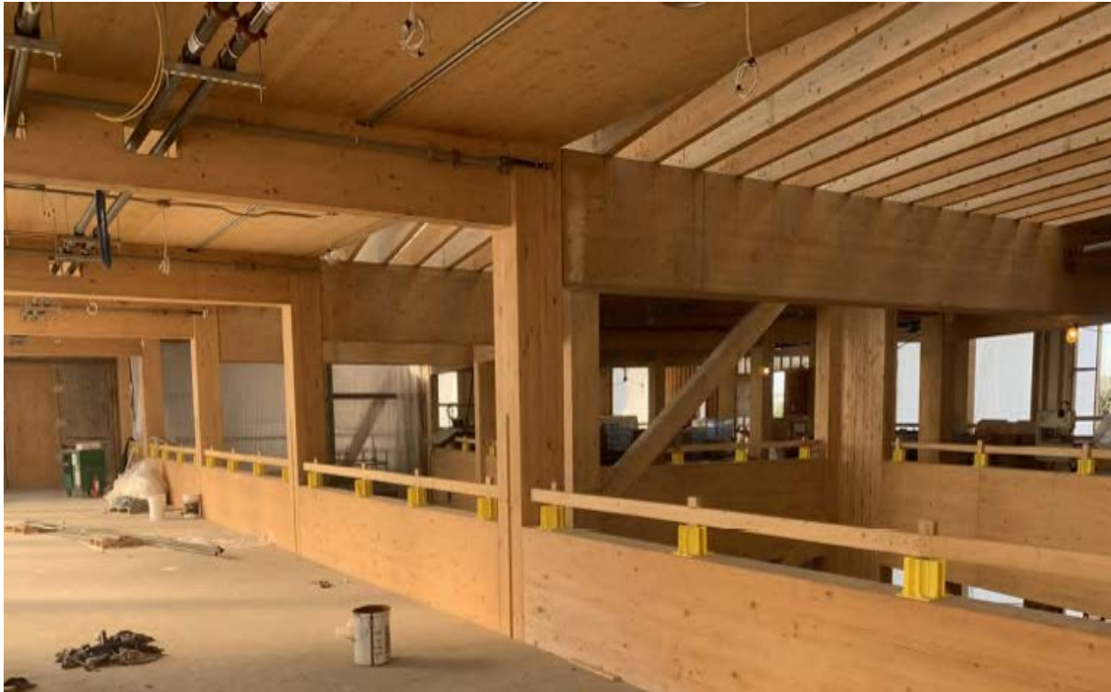
4 th Floor West