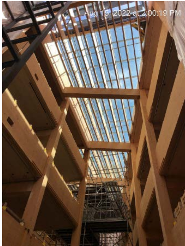
East Atrium and Skylights