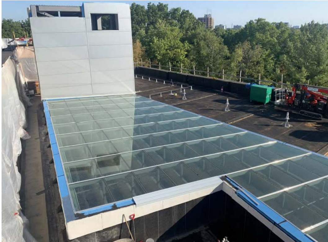
Lower Roof and Solar Chimney