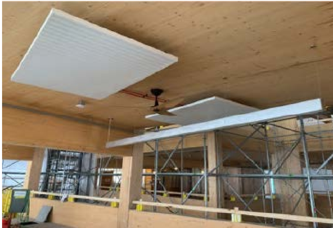
Mockup of Light Fixtures and Radiant Panel