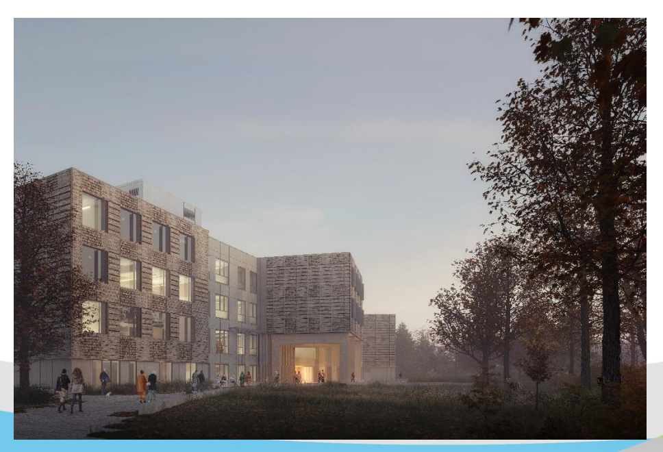
Looking west to the building entrance.