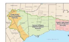
CTC Source Protection Region

Proposed Amendments | TRCA's Comments | About the Conservation Authorities Act